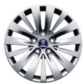
Alloy wheel 15-spoke Rotor 18×8" (ALU 103)