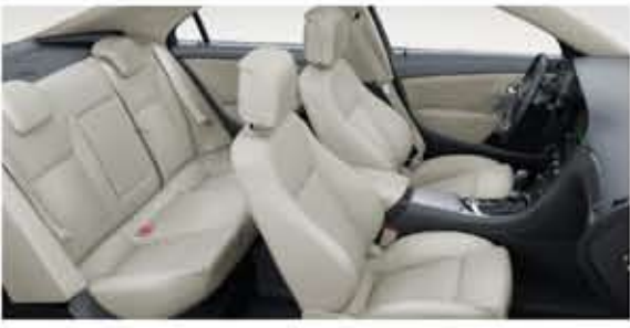
Leather comfort seats. Parchment upholstery. Jet Black cabin. Parchment door inserts. (Optional)