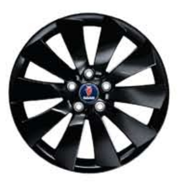
Alloy wheel 10-spoke Turbine Black 19×8½" (Accessory)