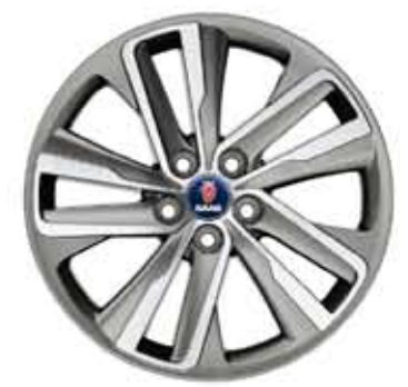
Alloy wheel 10-spoke Edge Silver 19 \times 8\frac{1}{2} " (Accessory)