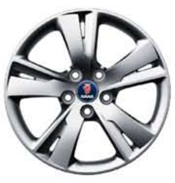
Alloy wheel 5-spoke Carve 18×8" (ALU 102)