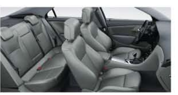
Leather/textile comfort seats. Shark Grey upholstery. Jet Black/Shark Grey cabin. Shark Grey door inserts. (Vector)