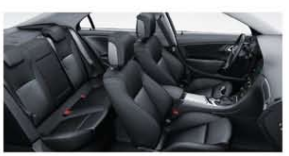
Woven textile comfort seats. Jet Black upholstery. Jet Black cabin. Jet Black door inserts. (Linear)