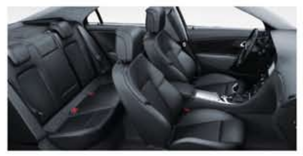
Leather ventilated sport seats. Jet Black upholstery. Jet Black cabin. Jet Black door inserts. (Optional)