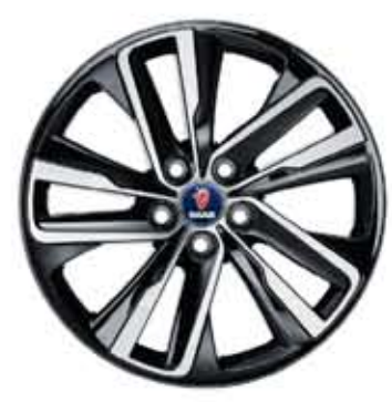
Alloy wheel 10-spoke Edge Glossy Black 19 \times 8\frac{1}{2} " (Accessory)