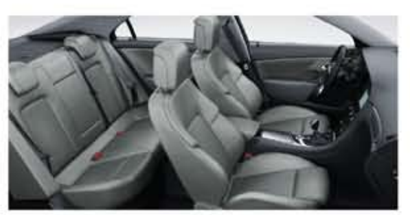
Leather perforated sport seats. Shark Grey upholstery. Jet Black cabin. Shark Grey door inserts. (Aero)