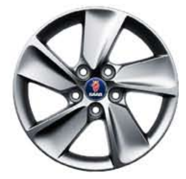
Alloy wheel 5-spoke Blade 17×7" (ALU 100)