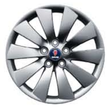
Alloy wheel 10-spoke Turbine 19×8½" (ALU 105)