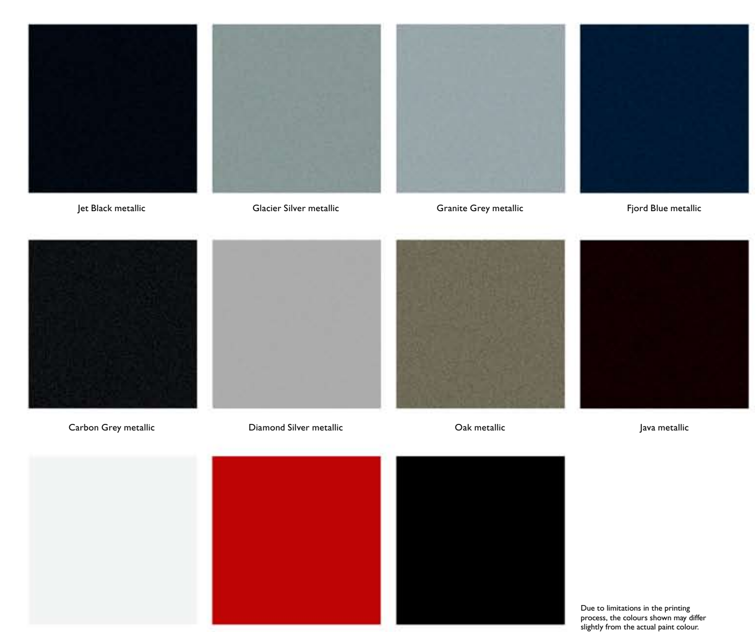
Arctic White solid Laser Red solid