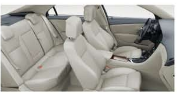
Leather comfort seats. Parchment upholstery. Dark Cocoa/Parchment cabin. Parchment door inserts. (Optional)