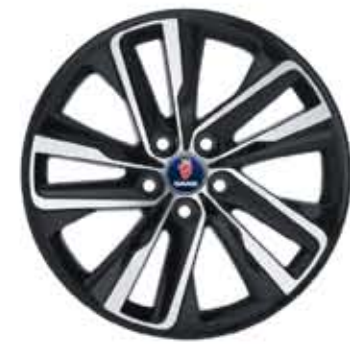
Alloy wheel 10-spoke Edge 19 \times 8\frac{1}{2} " (ALU 104)