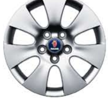
Alloy wheel 7-spoke Core 17×7" (ALU 101)